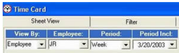
Click on the image to view a full-size screenshot.

In addition to a variety of practice management modules, BillQuick 2003 provides PDA and Web interface programs for time and expense management, allowing more efficient data entry for remote or traveling personnel.